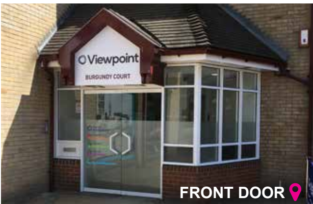
FRONT DOOR 📍