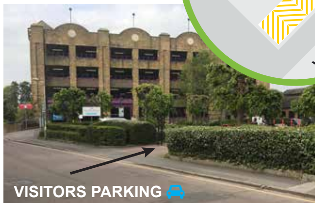
VISITORS PARKING 🚗